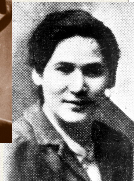
► Roza Robota